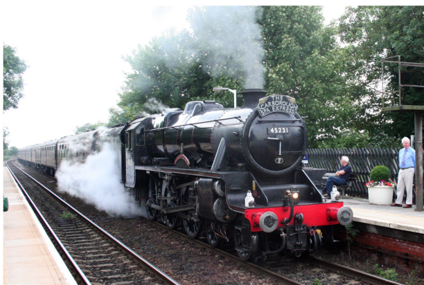
LMS Black Five 45231 Sherwood Forester waits at Poppleton on a Scarborough Spa Express August 2009