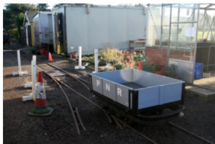
Newly installed point at Bog Junction, December 2011