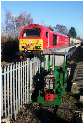
The Northern Star charter passes Loweco en route to Harrogate

12 December. This means that there is no capacity for charter trains to run. While they have not been frequent charter trains have brightened up the scene. Older readers will remember the steam hauled Scarborough Spa Express and we have had visits from the Northern Belle and Royal Scotsman luxury trains. On 20 November, which coincided with a Nursery sales day, Pathfinder ran The Northern Star, which will probably be the last charter, from Eastleigh to York, Harrogate, Leeds and return. In spite of passing through Poppleton faster than the regular service trains, it was a bit of whimper, as it wasn't a £10,000 a ticket luxury train and the locomotive was a class 67 diesel, not the most attractive of locomotives.