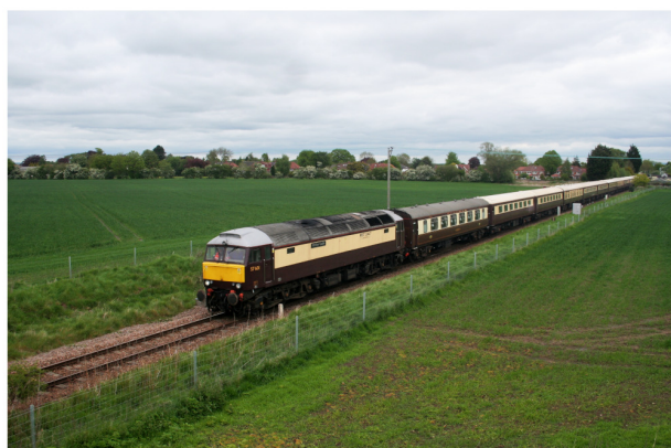
57601 Windsor Castle hauls The Northern Belle through Poppleton, May 2021

Not exactly a charter train, 37402 Stephen Middlemore 23.12.1954 - 8.6.2013 propels inspection saloon Caroline through Poppleton,