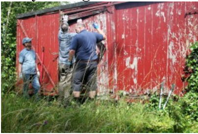
Removing the rotten door

and covered up the gap with the plastic covers donated to the Nursery several years ago.