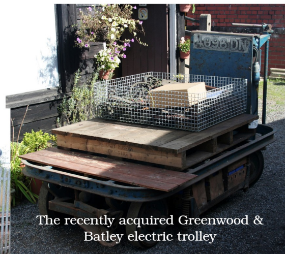
The recently acquired Greenwood & Batley electric trolley