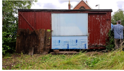
The container with the temporary plastic covering, the remains of the door are on the left.