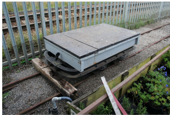
This was the end of the line at the time.