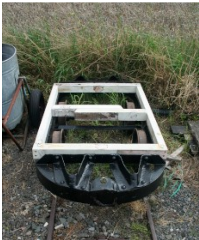
Chassis with newly fitted wood.